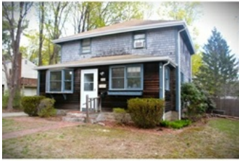
Exterior - Front