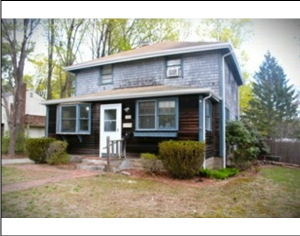
Exterior - Front